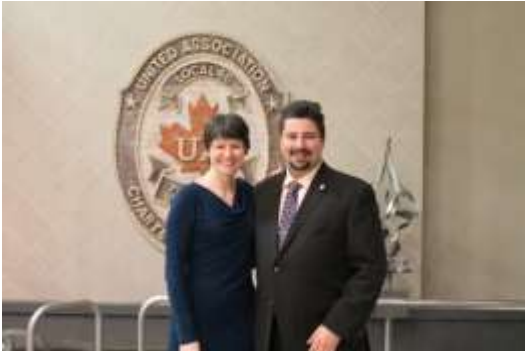
Megan Leslie, MP and Dan Harris, MP