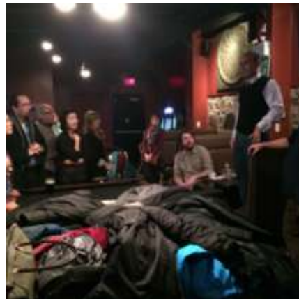
SSW NDP with MP Nathan Cullen